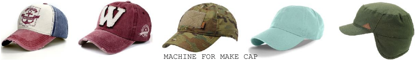
MACHINE FOR MAKE CAP